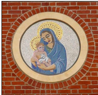
'Mane nobiscum Domine' (Abide with us O Lord)

Date of policy review: April 2019 Next review: April 2022